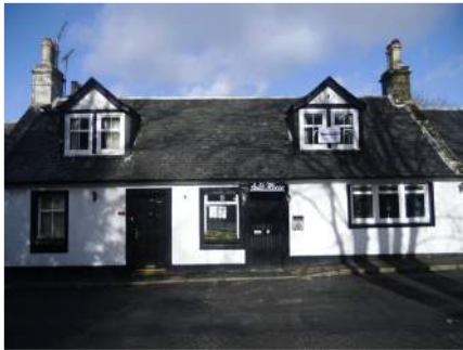
Auld Hoose 68 Main Street, KA3 4AG 1 or 2 changing ales

Conservation village on the road between Lugton and Kilmarnock. Unfortunately the other village real ale pub is now closed.