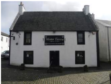
Weston Tavern 27 Main Street, KA3 2RQ 1 changing ale from a local brewery

An attractive village just NW of Kilmarnock.