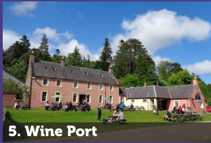
5. Wine Port