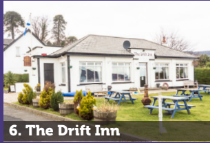
6. The Drift Inn