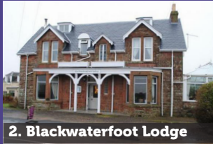
2. Blackwaterfoot Lodge