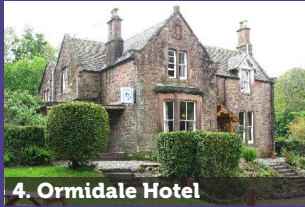
4. Ormidale Hotel