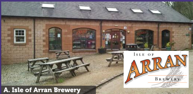
A. Isle of Arran Brewery

This leaflet has been produced by the Ayrshire & Wigtownshire Branch of CAMRA - the Campaign for Real Ale - in order to highlight the various outlets selling cask ale on the Isle of Arran. Copies of our free multi award-winning "Full Pints" magazine are also distributed to all the outlets.