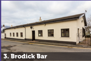
3. Brodick Bar