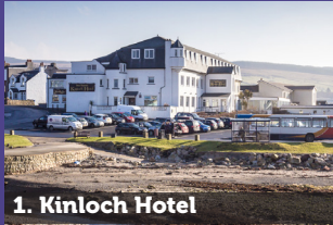
1. Kinloch Hotel