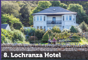
8. Lochranza Hotel