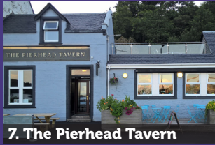
7. The Pierhead Tavern